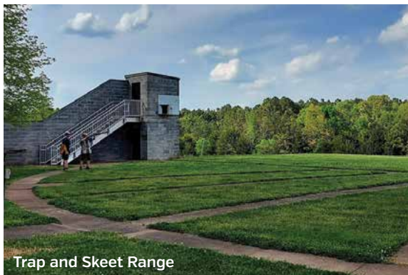
Trap and Skeet Range

Volunteers and the Friends of Henry Horton assist in protecting and preserving the cultural and natural resources of their favorite state park. They do this by giving of their time and talents to ensure the park’s integrity for future generations to enjoy. It’s easy to show your support—join the friends group or participate in one of the many volunteer opportunities we offer. To learn more about the Friends of Henry Horton, visit friendsofhenryhorton.com .