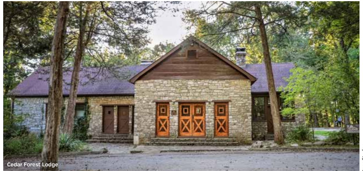
Cedar Forest Lodge

To learn more about volunteer opportunities in your area visit tnstateparks.com .