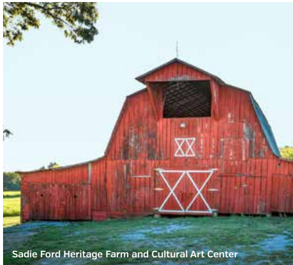
Sadie Ford Heritage Farm and Cultural Art Center